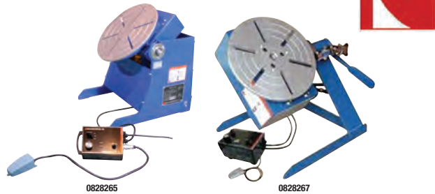
Table Top Portable Welding Positioner & Controller